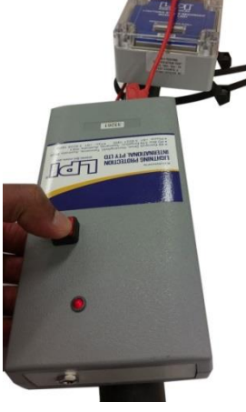
Figure 5: Step 3