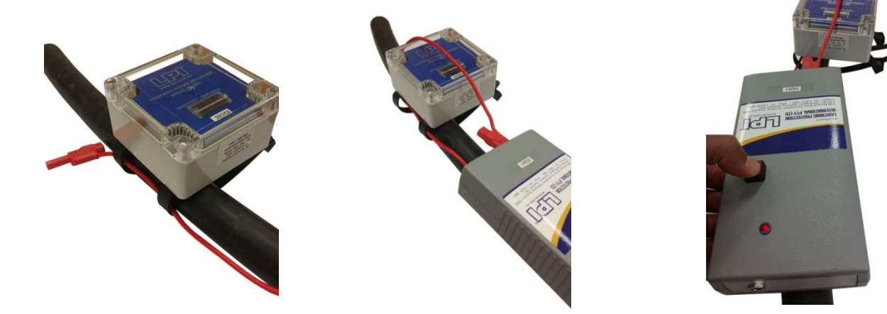
Figure 3: Step 1